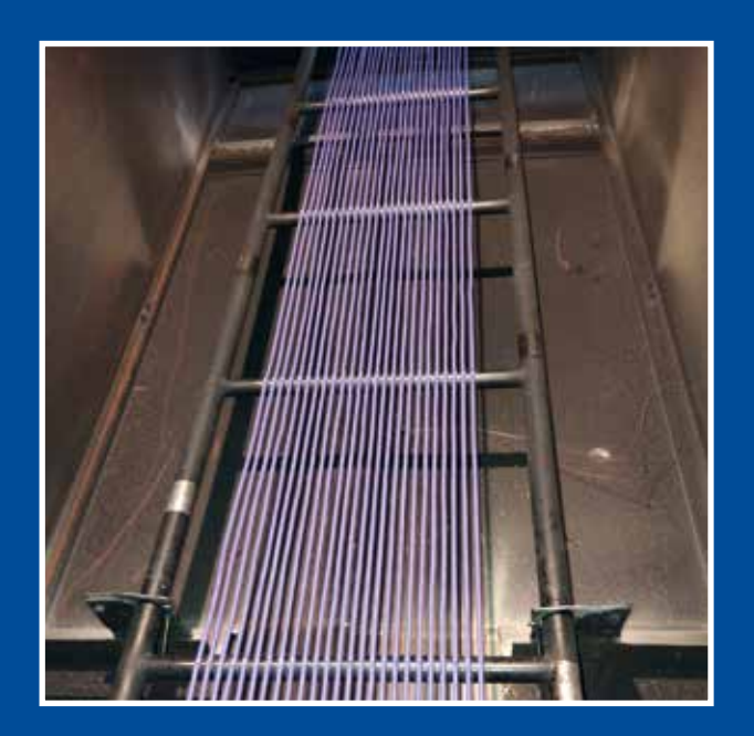
Figure 1 and 2 -Market Surveillance Testing (EN50399) of a non-Draka Category 6 U/UTP "B2<sub>ca</sub>" classified cable (supplied in a Reelex box)