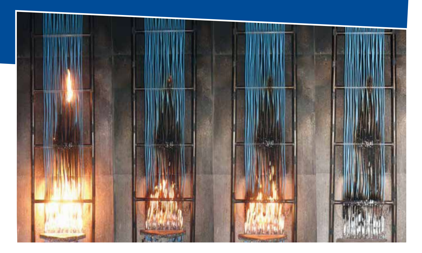
Figure 4 - Draka Category 6 U/UTP C<sub>ca</sub> D64 Cable Successfully Achieving Euroclass C<sub>ca</sub> Classifiction in a EN50399 Test

Figure 4 shows an example of one of multiple EN50399 tests conducted internally by Prysmian Group with D64. This test used cable from the inner most section of a Reelex box, where the indentions induced in the sheath by the box loading process is the most severe and so represents the worst-case condition of cable when installed.