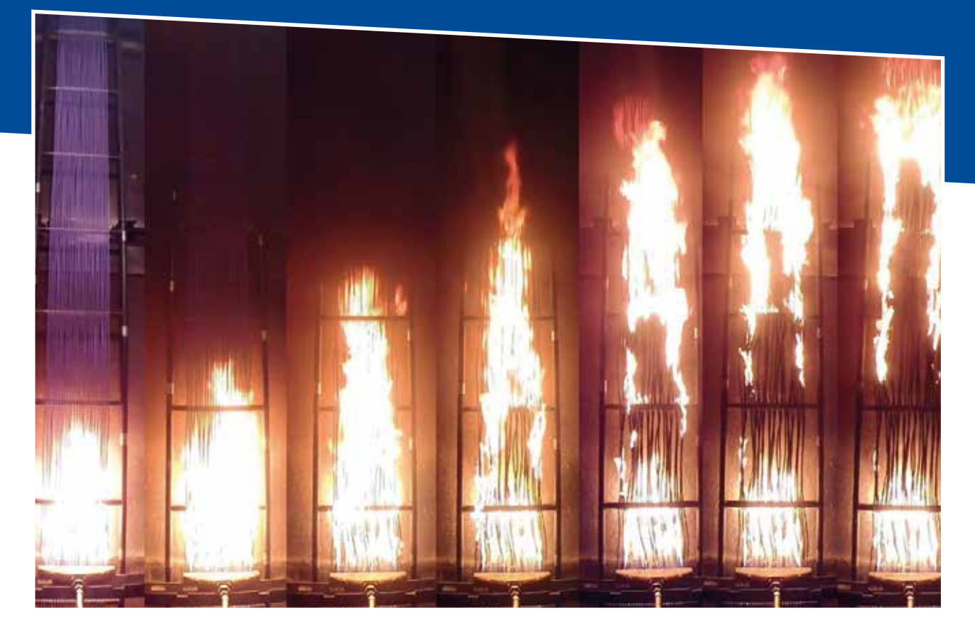
Figure 3 - Photo sequence showing the test progression of the cable shown in figs 1 and 2 - Time scale from left to right is < 6 mins

This phenomenon is already well known as the same effect is seen on transmission tests as well as mechanical.